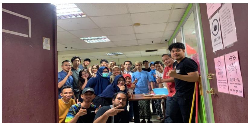
Figure 3. Indonesian Students Celebrate Ramadhan Month