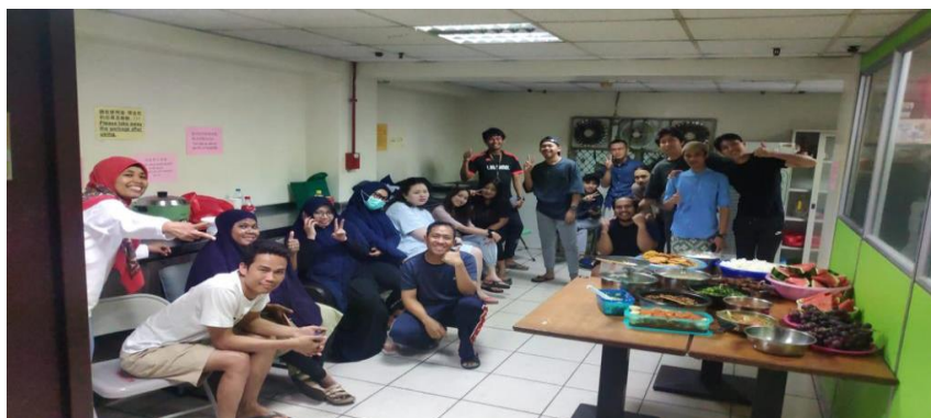
Figure 2. Breaking Fast together in the Month of Ramadan